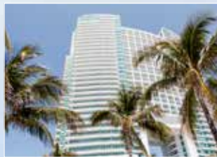
The Diplomat Beach Resort

Please review this prospectus and submit your application as soon as possible as space is limited and will sell out quickly.