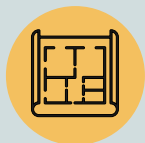
Exhibit Floor Plan page 4